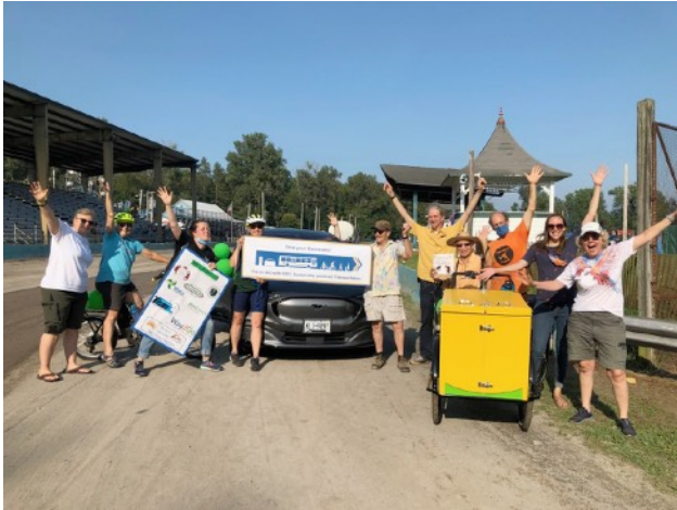
Staff and community members pumped up after a day at the parade

Elsewhere in this newsletter are updates to the almost completed – maybe even done by the time this mails – upgrades to the heating, cooling and ventilation systems at UPL. To those who have joined in as UPL Association Members now and in the past – THANK YOU!!! It is your support, through involvement and contributions, that make it possible for such improvements in the way our wonderful community operates.