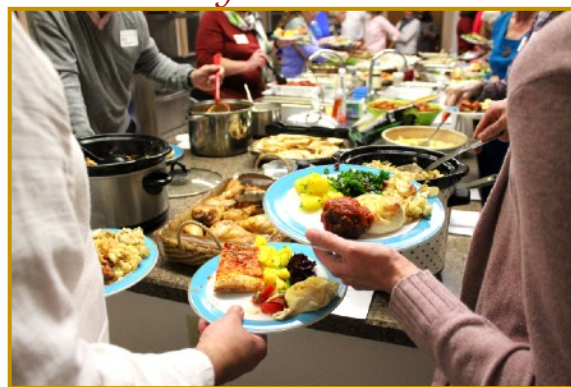
Filling plates at our 38th annual Candlelight Dinner