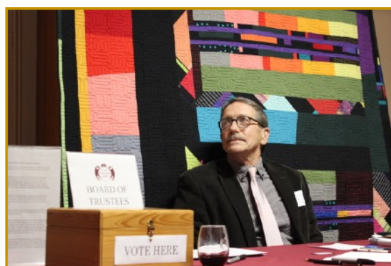
Board of Trustees election