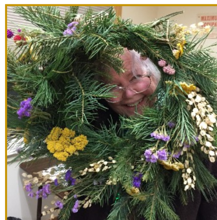
Evergreen Wreath Class with Thistleflower Farm