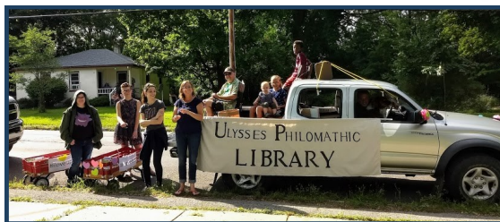
The library won 2nd prize in the Fireman's Parade!

Thanks to the hard work of trustees and staff, the entire library was upgraded to LED lighting in 2018.