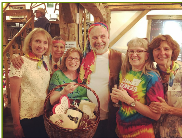
Libations for the Library at Americana Winery

The library is now loaning Empire Passes to NY State Parks! This popular service gave dozens of families and individuals free access to our beautiful state parks.