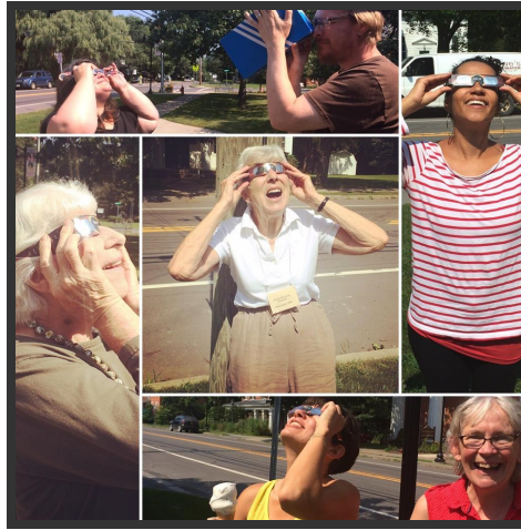
We watched the eclipse together...