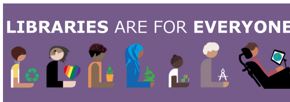
...and went FINE FREE!