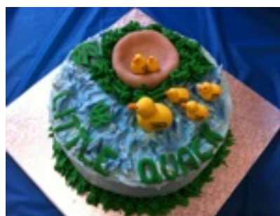
"Little Quack" cake

The Silent Auction will also have a "home" theme, and pictures and descriptions of auction items will be available for pre-bidding, as in the past. Mark your calendars and plan to join us at the library on October 21 for this fun family day!