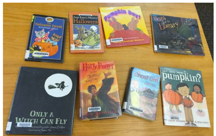
Books to inspire from the UPL collection

Winners will be decided by "popular" vote. Tickets may be purchased for $1 each and placed in a box next to the cake being voted for. The cake receiving the most tickets, or votes, will be the winner. There will be one winner in each age category. Cakes will go home with the lucky winners whose raffle tickets are drawn.